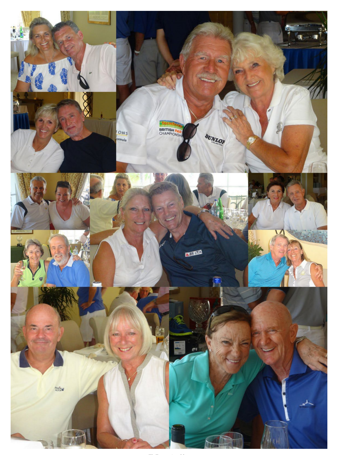
Hillbillies Vs Sanddancers